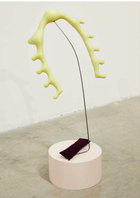
Martha Poggioli Passage Simulation

In contrast to the MFA in Studio, Designed Objects, the Master of Design in Designed Objects (MDDO) program is for individuals looking for immersive training to build the critical and technical skills necessary for advanced object design practice. The 66-credit MDDO program is for students who wish to study within a structured, course-based curriculum of Designed Objects-specific studios, seminars and technical labs.