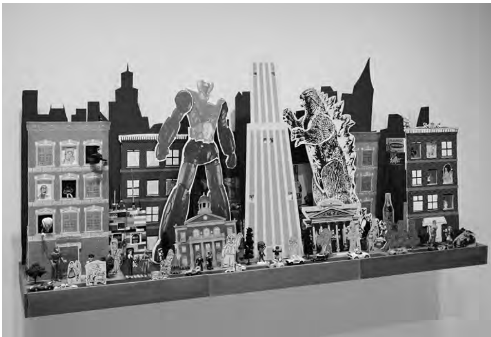
Noah Sherbin A City Scene Screen print and digital print on various papers and foams, found toys, and mixed media 2022