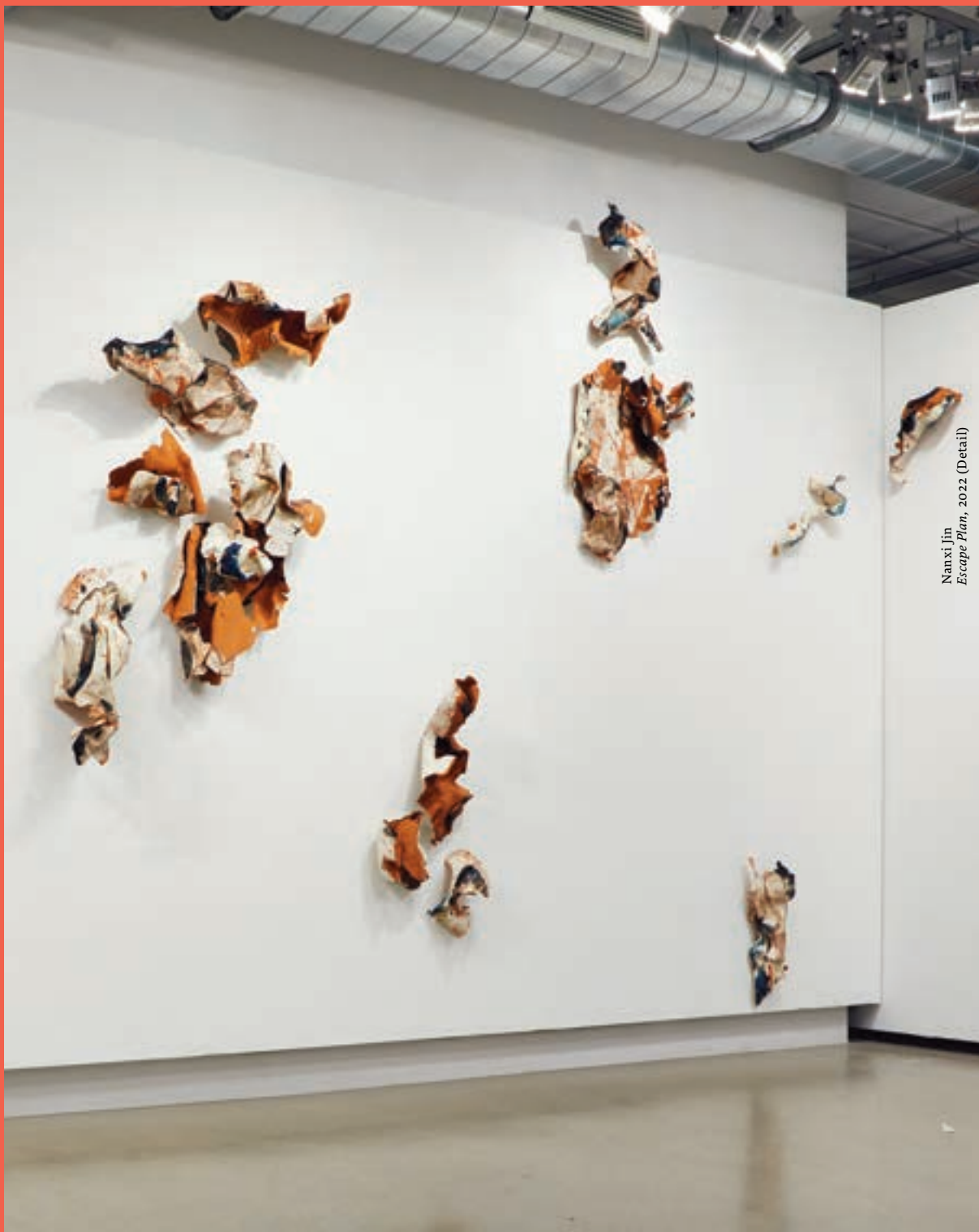
Nanxi Jin Escape Plan, 2022 (Detail)