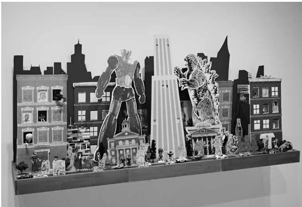
Noah Sherbin A City Scene Screen print and digital print on various papers and foams, found toys, and mixed media