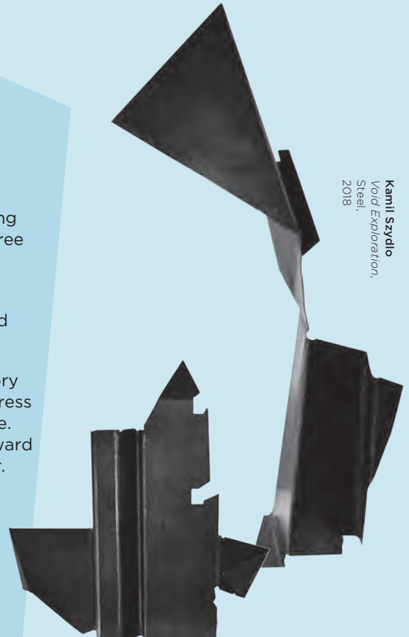
Kamil Szydio Void Exploration, Steel, 2018